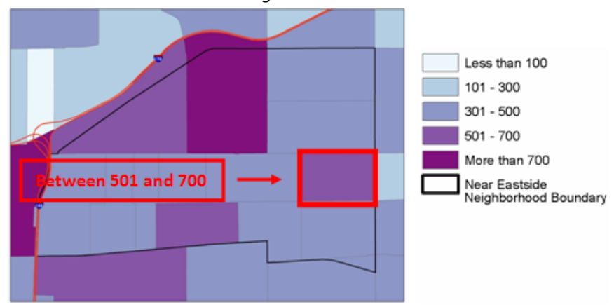
Figure 2: Number of Part 1 Crimes and Simple Assaults in 2008 by Census Tract in Near Eastside Neighborhood