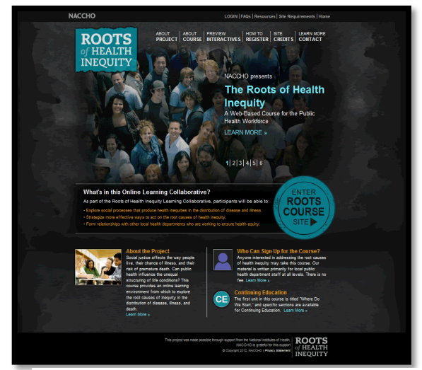
Roots of Health Inequity Homepage rootsofhealthinequity.org

Can public health influence the unequal structuring of life conditions? The National Association of County and City Health Officials (NACCHO) thinks public health can reach the