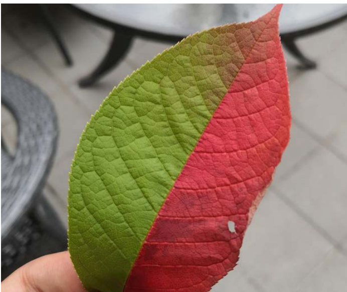
As seen by someone without colorblindness