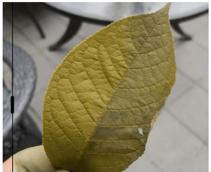
As seen by someone who is colorblind