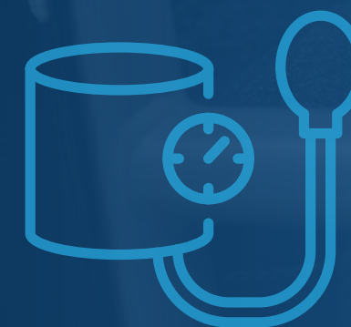
Blood Pressure Cuff